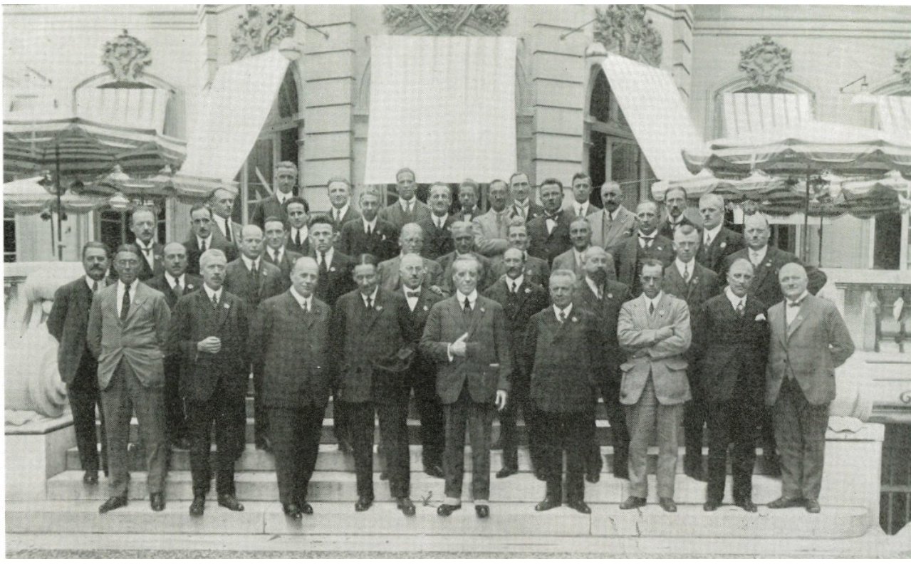
The UCI celebrates its 125th anniversary

Next month, the Union Cycliste Internationale (UCI) will celebrate an important milestone: the 125th anniversary of its creation.