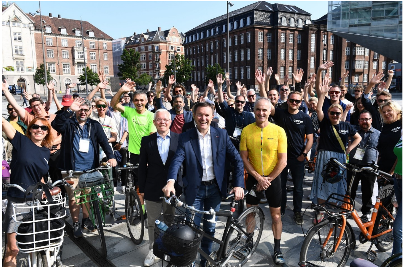
2025 UCI Cycling Esports World Championships (15 November 2025)

The 2025 UCI Cycling Esports World Championships live final will take place on 15 November 2025 in Abu Dhabi,